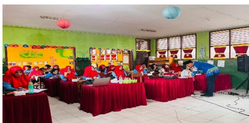
Figure 1. Photo of Islamic Leadership Training Activities Based on the Leadership Characteristics of the Prophet Muhammad at Bumi Waras Elementary School in Bandar Lampung

The final post-test on the teaching material contained questions that were almost identical to those in the pre-test, but with the addition of new questions on Islamic leadership based on the leadership characteristics of the Prophet Muhammad (peace be upon him). This evaluation used the Quizizz application, and the students' scores on the pre-test and post-test were analyzed to determine whether the activities carried out were beneficial to the participants or not. The implementation of this post-test is documented in the following photo: