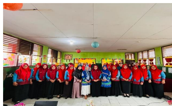
Figure 3. Group Photo of Training Activities Islamic Leadership Training Based on the Leadership Characteristics of the Prophet Muhammad at SDN Bumi Waras Bandar Lampung.

the leadership characteristics of the Prophet Muhammad at Bumi Waras Elementary School in Bandar Lampung.