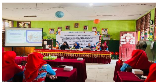
Figure 2. Photo of the delivery of material for Islamic Leadership Training based on

the leadership characteristics of the Prophet Muhammad at Bumi Waras Elementary School in Bandar Lampung.