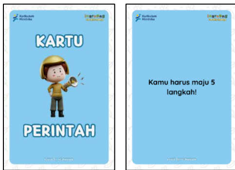
(a) Cover (b) Content