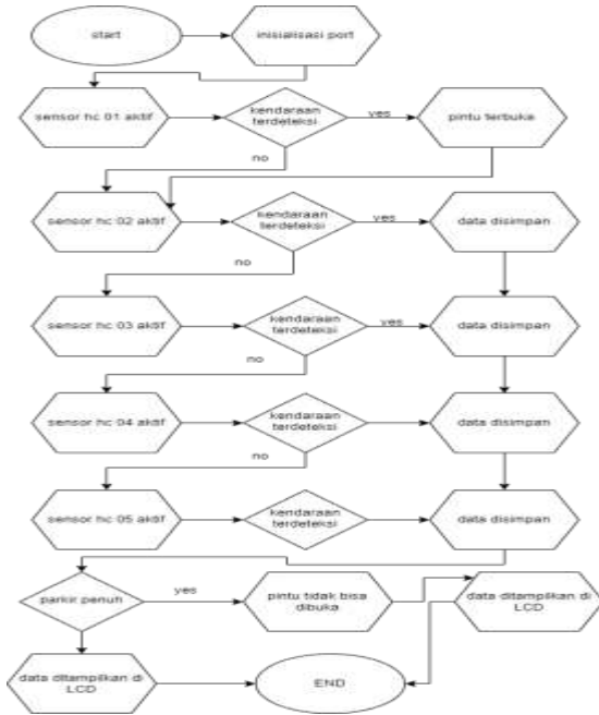
Figure 1. Programmed Code

including ultrasonic sensors, servo motors, and Arduino microcontrollers. The following diagram illustrates the overall system block diagram: